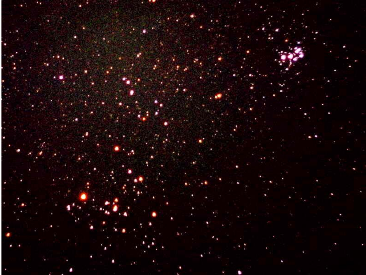
Figure 2.1: wide-angle photograph of the Hyades (left) and Pleiades (upper right), by Hermann Gump. The very bright red star at lower left is Aldebaran ( \alpha Tau).